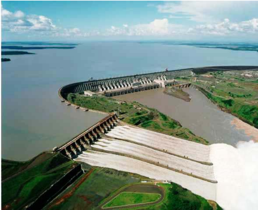
Itaipú dam (BR-PY)

“Citizens, Civil Society and the Innovation Union”